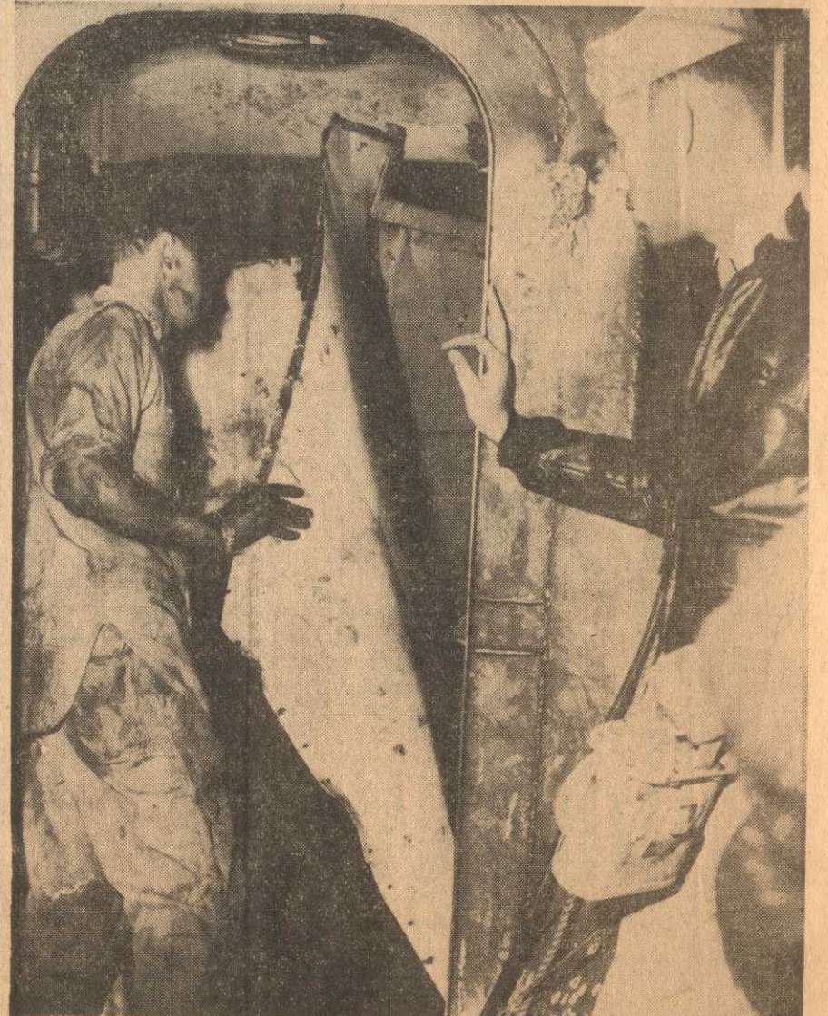
SEARCH FOR ADDITIONAL VICTIMS: Unidentified crewmen of Bennington make new search for victims who may have been overlooked following disaster. This is wrecked partition near bow of vessel.