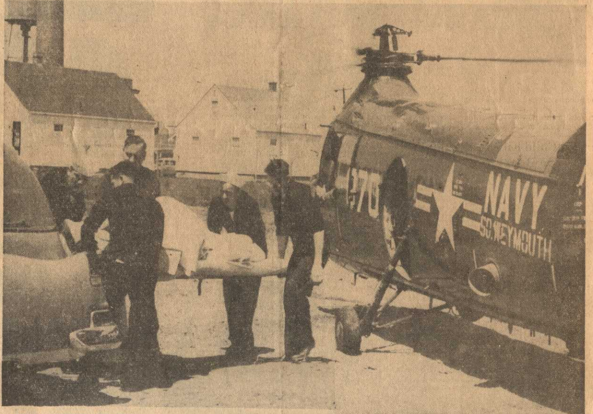
FLY INJURED TO HOSPITAL: Blanket-wrapped victim of fire and explosion is carried from helicopter to ambulance. Helicopters shuttled most badly injured to Naval Hospital at Newport, R. I., as Bennington sailed up Narragansett Bay to Quonset.