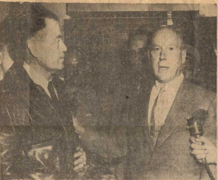
NAVY SECRETARY ON SCENE: Secretary of Navy Charles A. Thomas (right) gives condolences for families of victims after carrier Bennington docked. Captain William F. Raborn, Jr., commander of carrier, is at left. Thomas flew to Rhode Island from Washington.