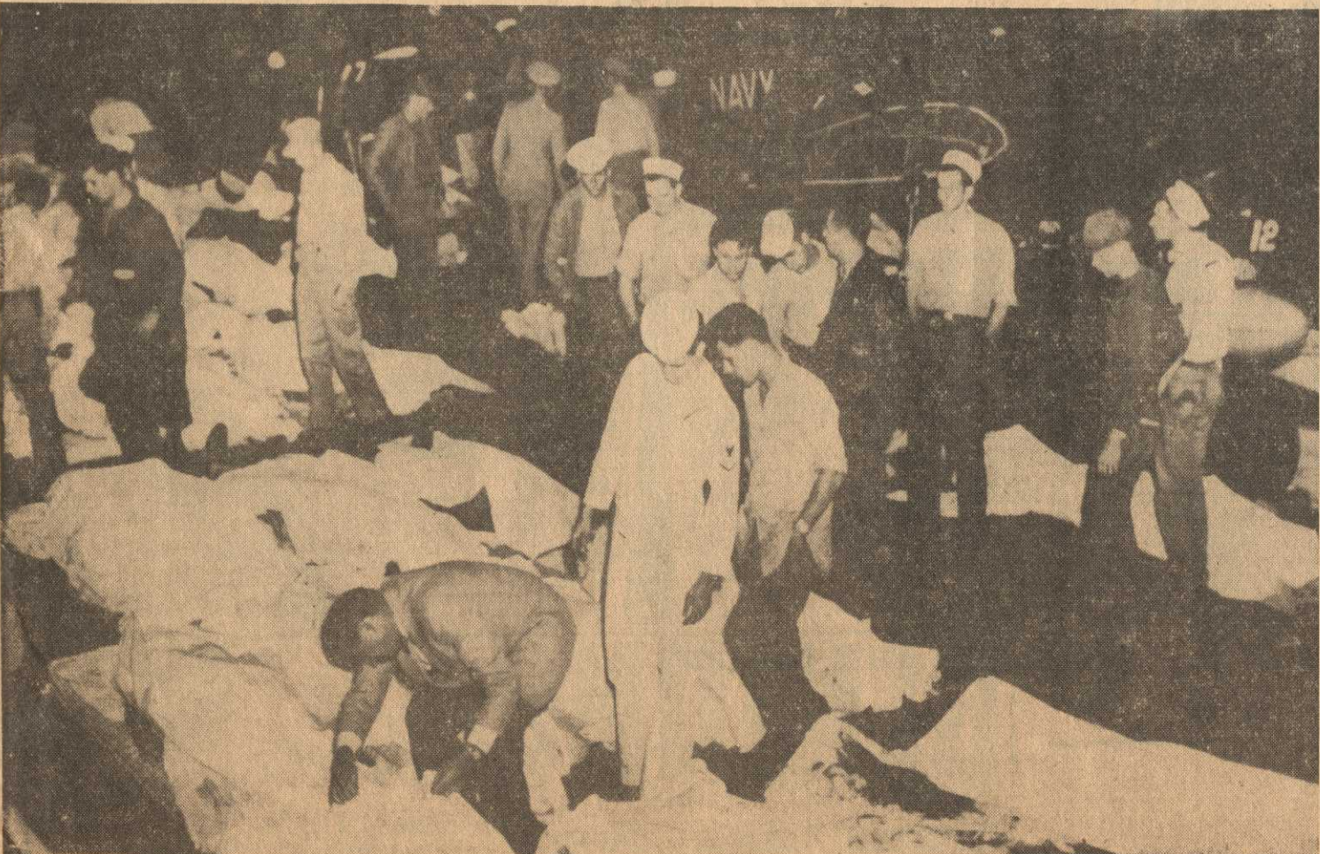
DEAD ABOARD CARRIER: Shrouded bodies of those killed aboard Bennington are checked for identification on hangar deck of vessel. Stored planes of big carrier are in background.