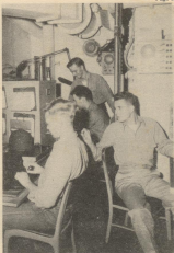
CWO Checks Comm. Yeoman