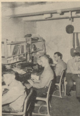
Capt.'s Office Manned and Ready