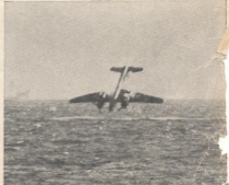
DEAD PIGEON: Both engines burning, this Jap bomber nosedives into the sea. A carrier's AA guns got her,