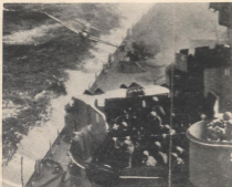
LAME DUCK: Jap pilot tries to get his limping Zero on a U. S. warship's deck. Instead, he plunged into the sea.

Official U. S. Navy photographs 20 feet and dives into the Pacific. Japs have expended large numbers of planes in attempts to crash on our ships,