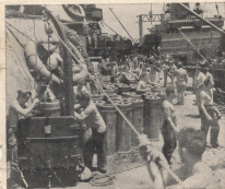
POWDER is taken on a battleship. Supply ship delivering it from advance base is alongside (right background).