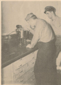
Testing Fuel Oil